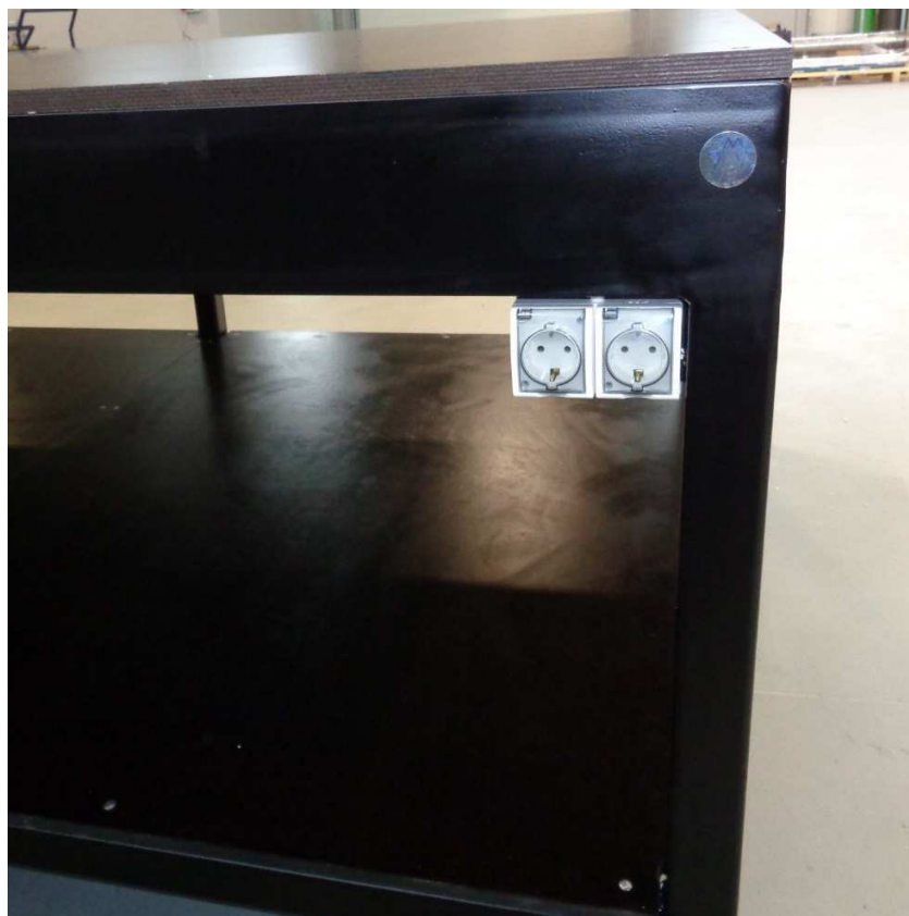
Work Bench detail with 22 mm thick work blade (multiplex) and plugs for the electric tools