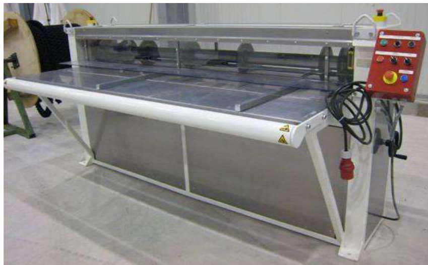
ICE-Trade Belt Slitting Table

After cutting the rubber slaps into strips, with the ICE-Trade Slitting Table, the Winding Machine can be put easily behind the Slitting Table to wind all the strips, as it features 4 castors with 2 of them with breaks. Once the winding job is done the Winding Machine can be put aside till the next winding job has to be done, so that no production place is taken by the Winding Machine.