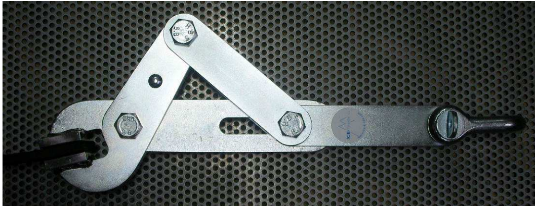
Belt Puller in the Straight Version