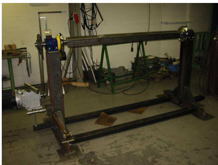
Winder under construction

For outside use the winders features “sliding beams” so that the winder can be dragged through the field behind a truck or shovel. Those winders have protective class IP 65.